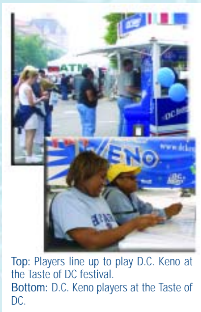
Top: Players line up to play D.C. Keno at the Taste of DC festival.

Throughout the year, D.C. Lottery agents were encouraged to sell, sell, and sell through a steady stream of sales competitions offering tickets to major sporting events, trips, cash, and promotional items. In addition, D.C. Lottery trade development (sales) representatives were retained to ensure that